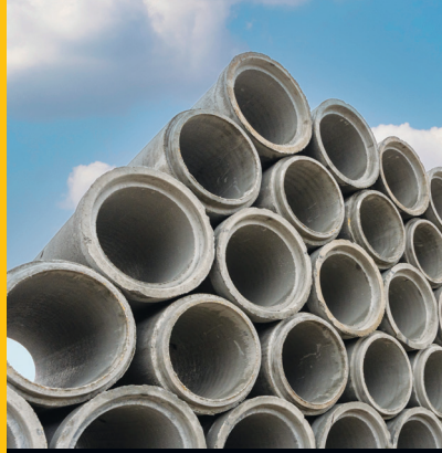
Precast Concrete Products