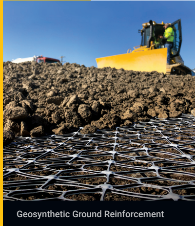
Geosynthetic Ground Reinforcement