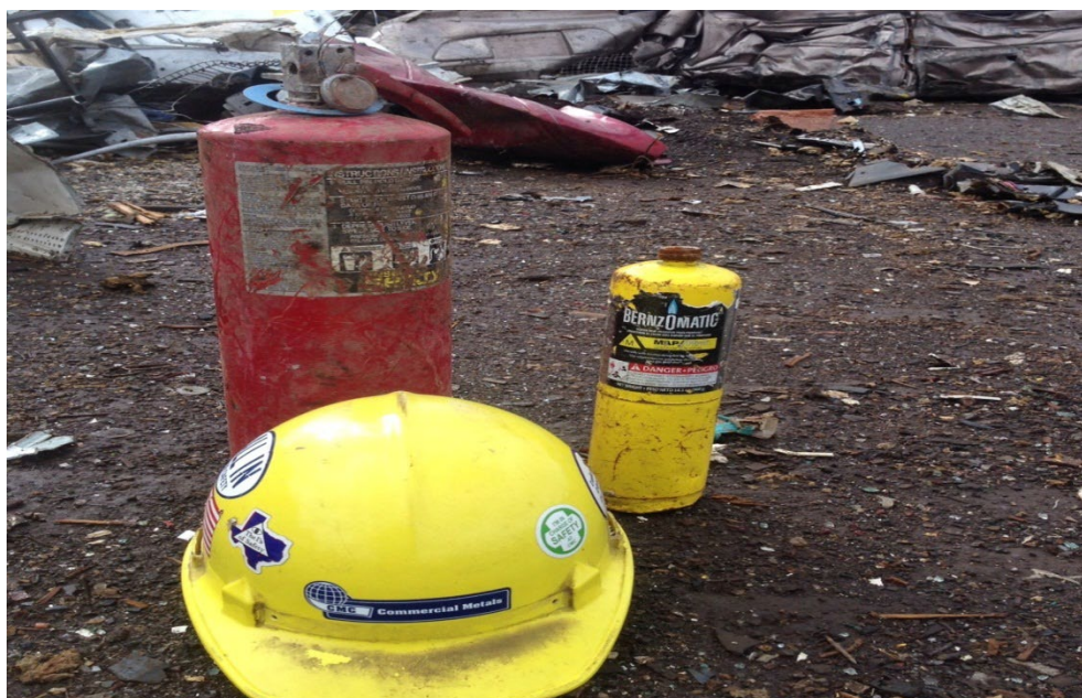
SMALL COMPRESSED GAS CYLINDERS FIRE EXTINGUISHERS