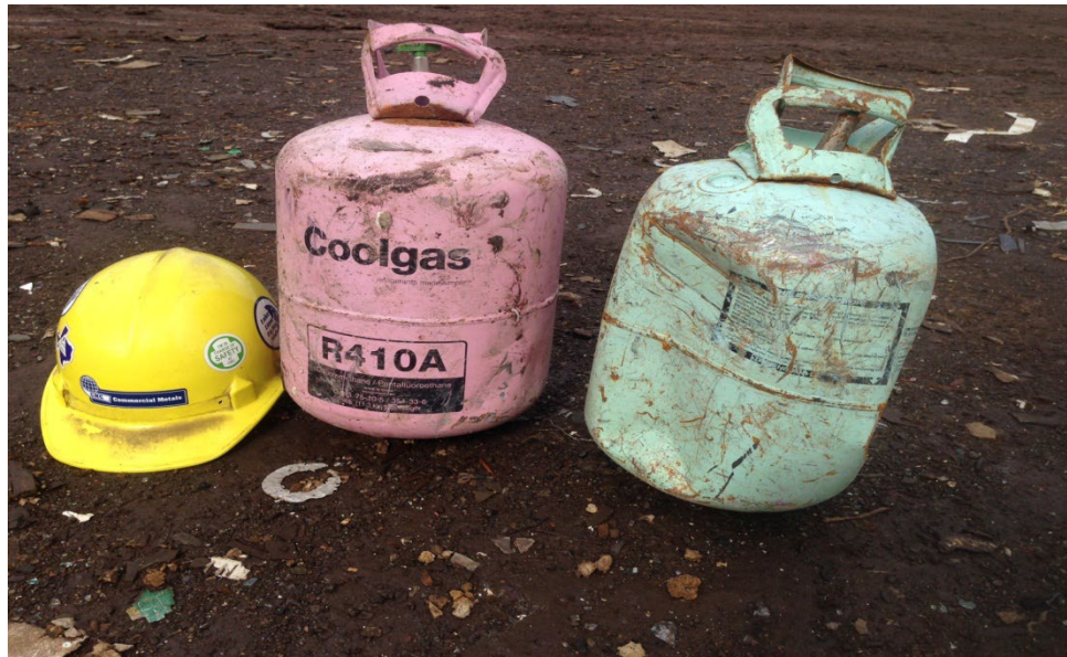
ACETYLENE / PROPANE CYLINDER FREON CANISTER