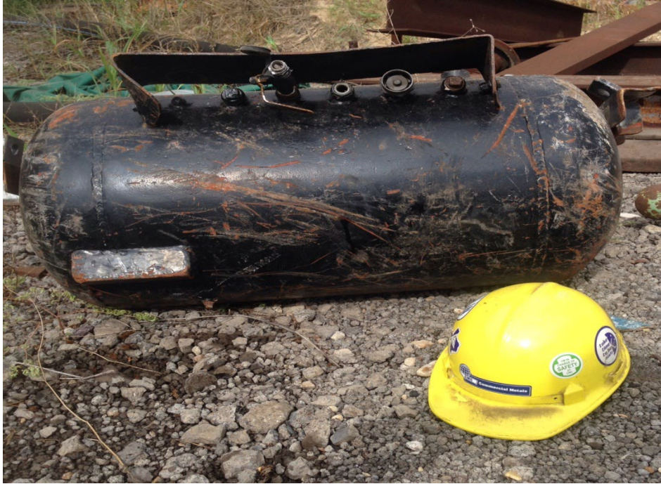
AIR COMPRESSOR TANK FUEL TANK