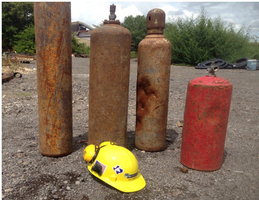
COMPRESSED GAS CYLINDERS