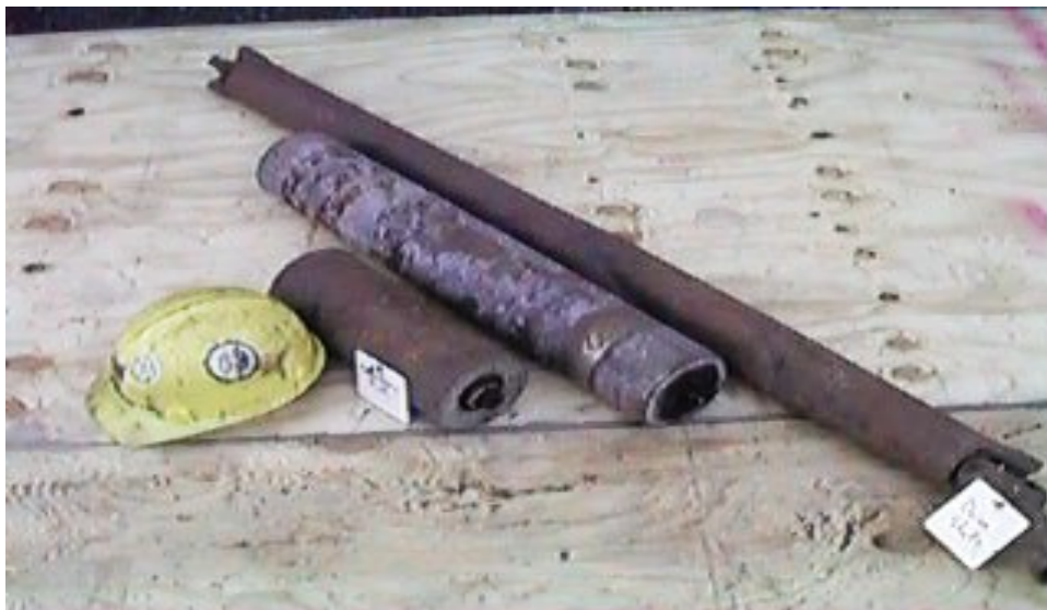
AUTO / TRUCK DRIVE SHAFTS & CONVEYOR ROLLERS